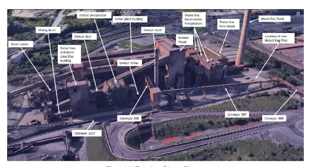
Figure 1: Existing Sinter Plant